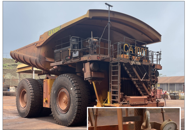
Komatsu Haul Truck 830E

In addition, extending oil life results in a reduction for labor and maintenance time and increase equipment availability.