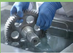
2 - SOAK