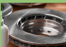
3 - RINSE