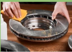
1 - PRE-CLEAN